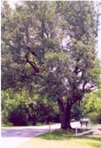
Fig orchards, satsuma orange orchards, and rice fields once flourished where Friendswood homes now stand. The last vestiges of them and the homes that the Quakers constructed are nearly gone, but the legacy left by those founders and early settlers remains. That legacy is the heritage of a way of life that did more to shape the character of the community than any brick and mortar buildings ever could.